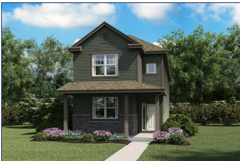
Elevation B - Colonial