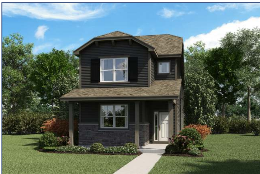
Elevation A - Cottage

3 – 4 Beds • 2.5 Baths • 2 Garage Bays • 1,875 fsf