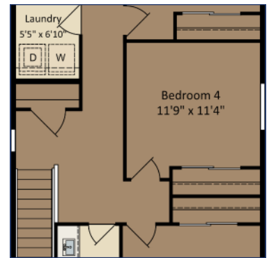
4th Bedroom in lieu of Loft (per plan)