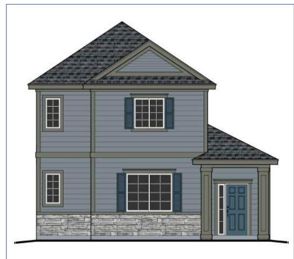
Elevation C – Colonial