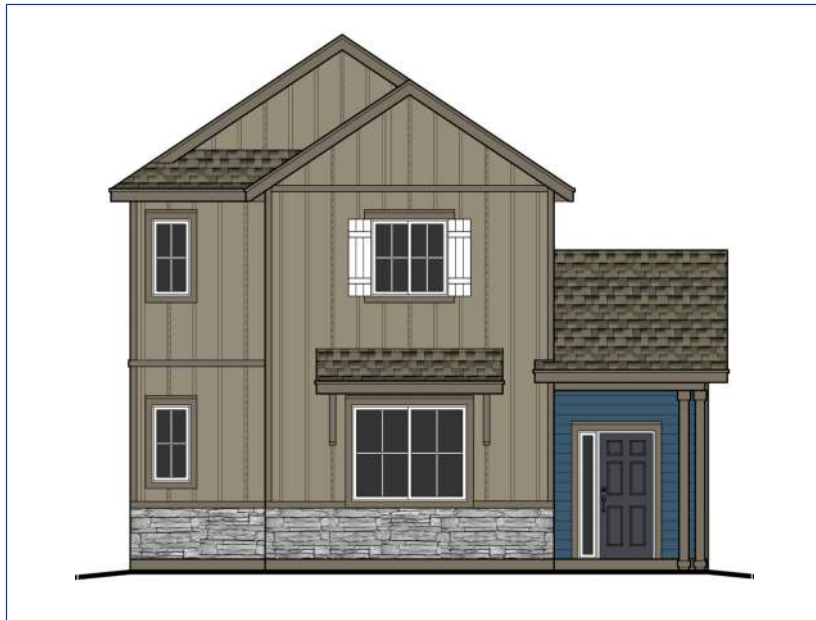
Elevation A – Farmhouse

3 Beds | 2.5 Baths | 2 Garage Bays | 1,992 fsf | Slab-on-grade