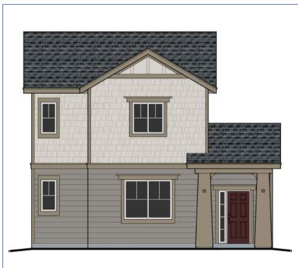
Elevation B – Craftsman