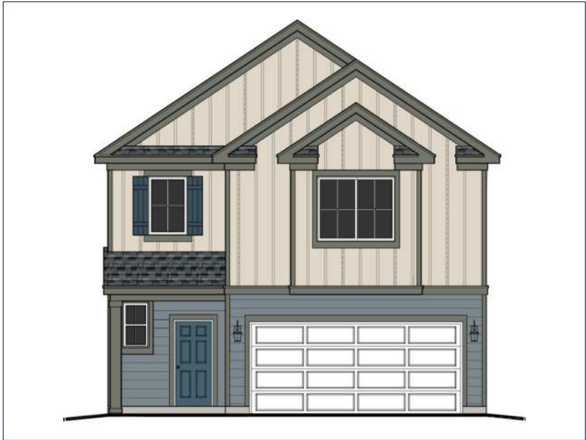
Elevation A – Farmhouse (2335 fsf)

3 Beds | 2.5 Baths | 2 Garage Bays | 2,329 – 2,337 fsf | Slab-on-grade