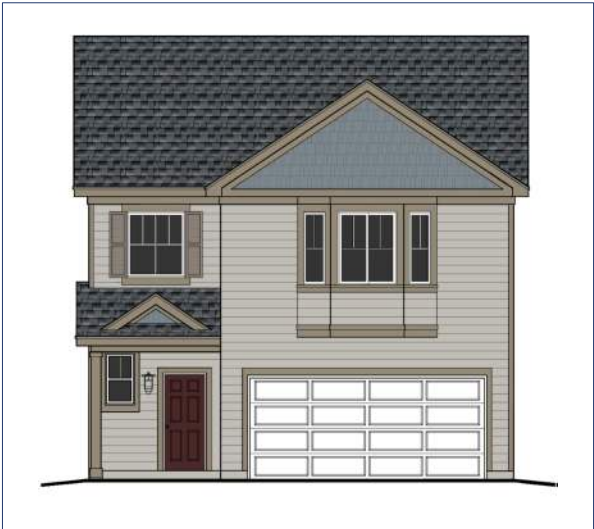
Elevation B – Craftsman (2329 fsf)