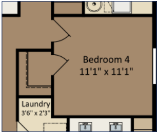
4th Bedroom in lieu of Loft (per plan)