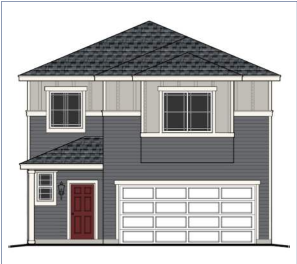
Elevation C – Prairie (2337 fsf)