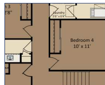
4th Bedroom in lieu of Loft (per plan)