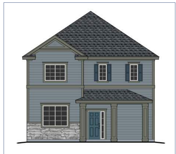
Elevation C – Colonial