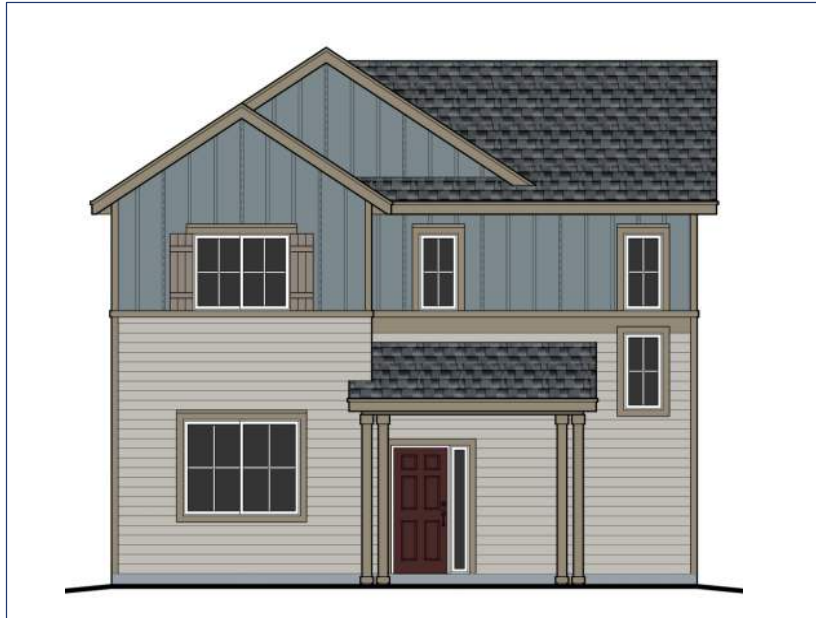
Elevation A – Farmhouse

3 Beds | 2.5 Baths | 2 Garage Bays | 2,168 fsf | Slab-on-grade