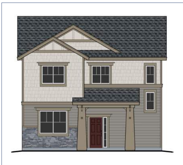
Elevation B – Craftsman