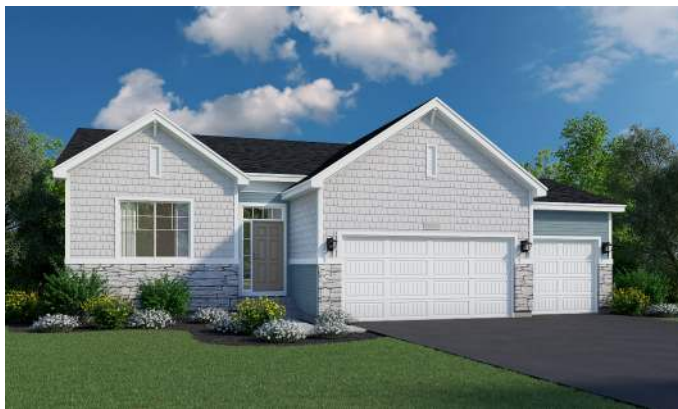
Elevation B — Cottage