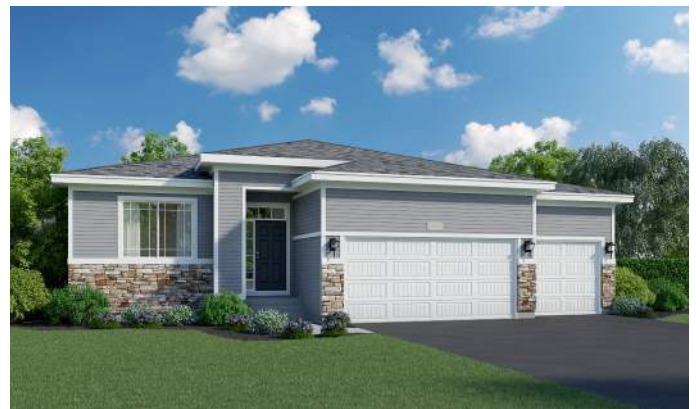
Elevation C — Prairie