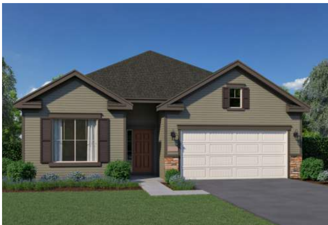
Elevation B – Colonial