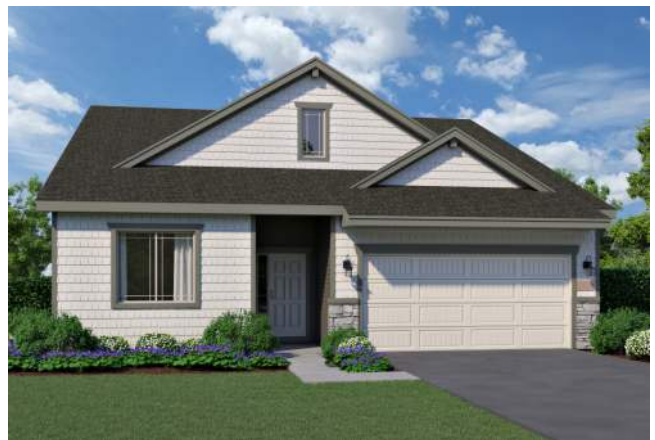
Elevation C – Cottage