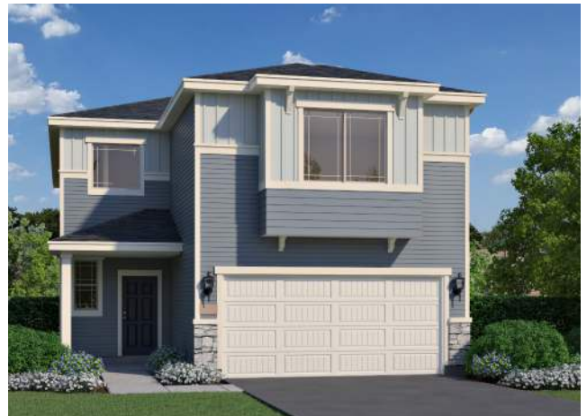
Elevation C – Prairie