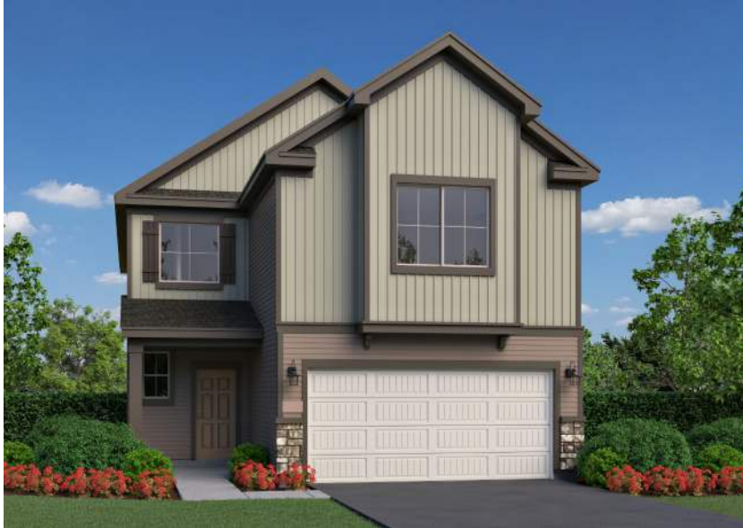
Elevation A – Farmhouse

3 – 4 Beds | 2.5 Baths | 2 Garage Bays | 2,335 fsf | Slab-on-grade