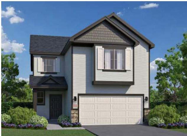
Elevation B – Craftsman