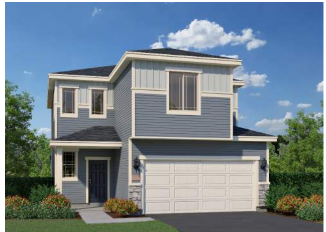
Elevation C – Prairie