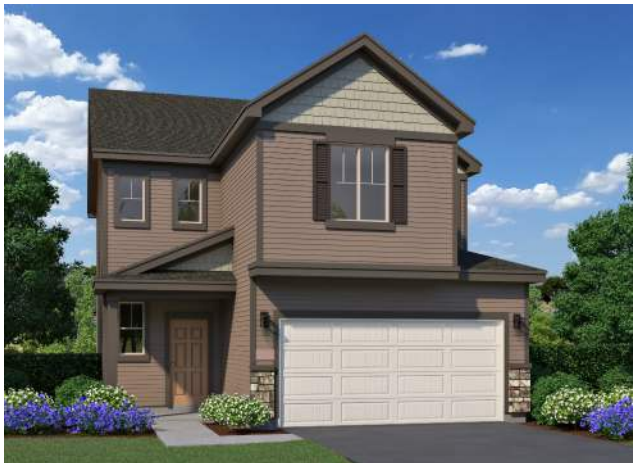
Elevation B – Craftsman