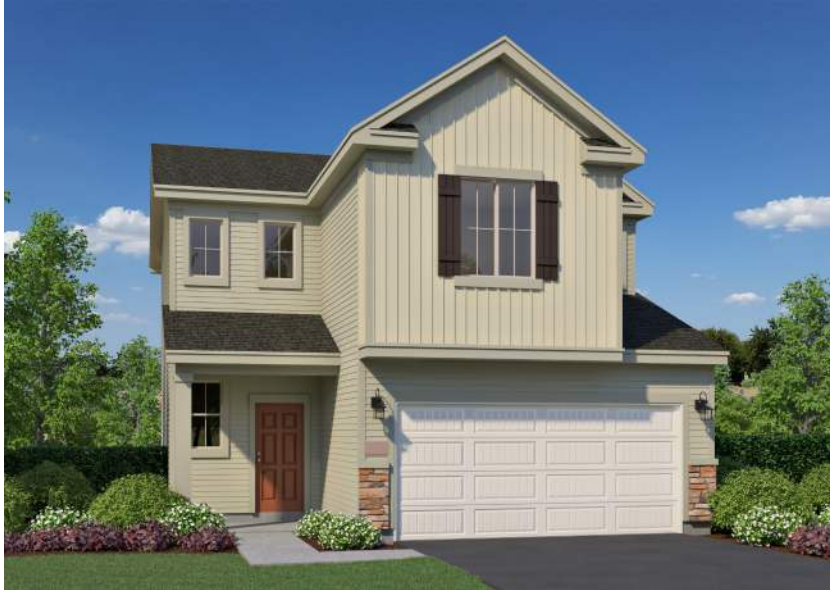
Elevation A – Farmhouse

3 Beds | 2.5 Baths | 2 Garage Bays | 2,051 fsf | Slab-on-grade